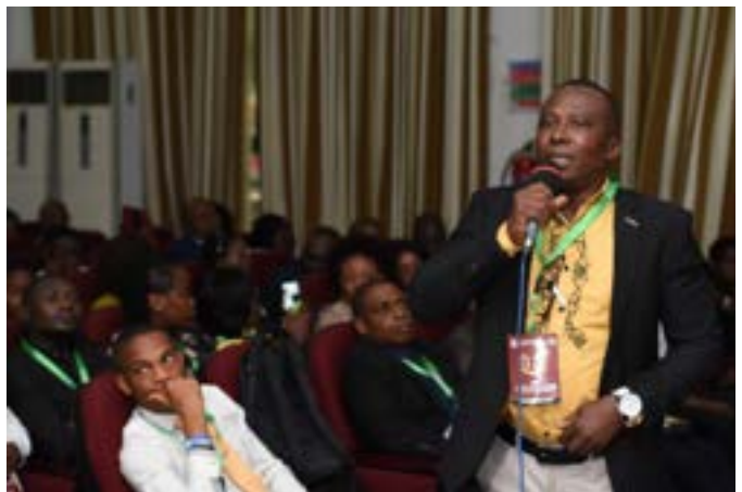
A Participant at the 12th MCPD