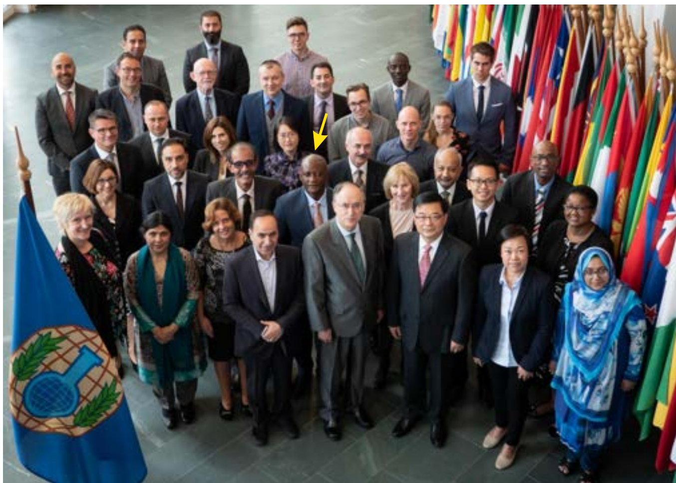
Arrow showing the Registrar/CEO of ICCON at 89th session of OPCW-SAB

The Scientific Advisory Board is comprised of 25 independent experts from OPCW Member States, and advises the OPCW's Director-General on scientific and technological issues relevant to the implementation of the Chemical Weapon Convention.