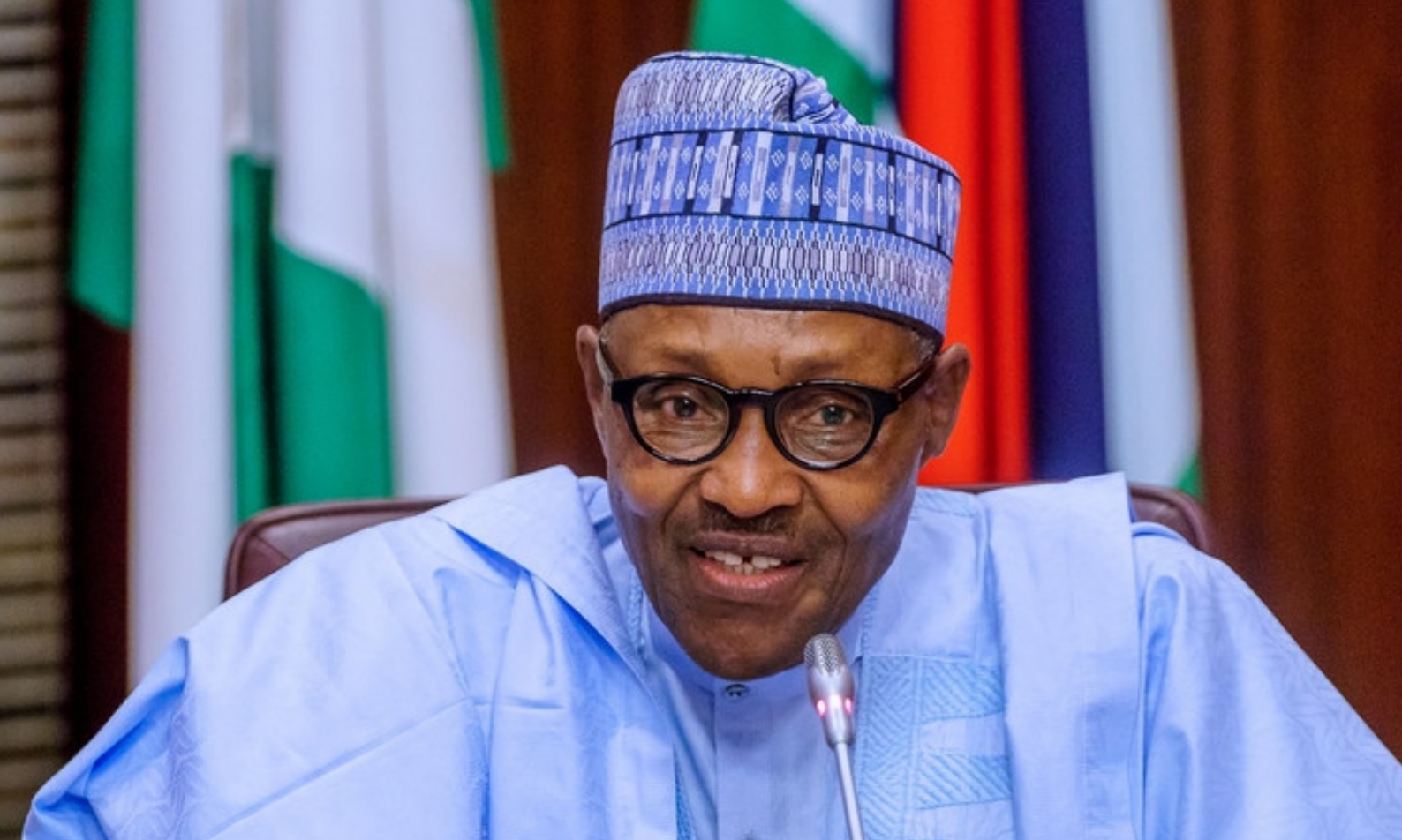
His Excellency, President Muhammadu Buhari, GCFR