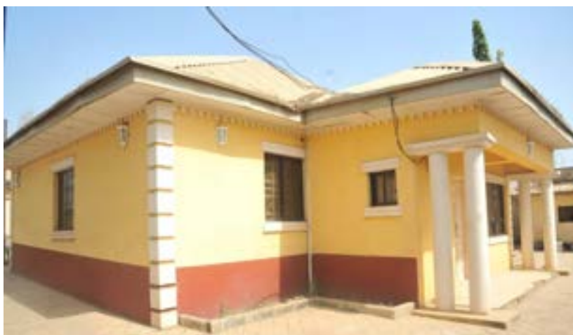
ICCON House, Federal Housing Authority, Lugbe, Abuja

"You are aware that a lot of research work from Nigeria are sent abroad for analysis, creating that gap so we believe that with the ICCON Research and Development Centre coming on board, most of such samples that are sent abroad will be sent to the centre for analysis and therefore the issue of capital moving out of the country will be drastically reduced".