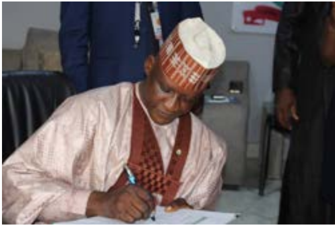
ICCON Registrar signing the visitors book at the National Institute for Security Studies (NISS).