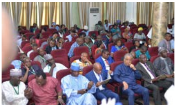
Cross section of participant at the 12th MCPD in Abuja