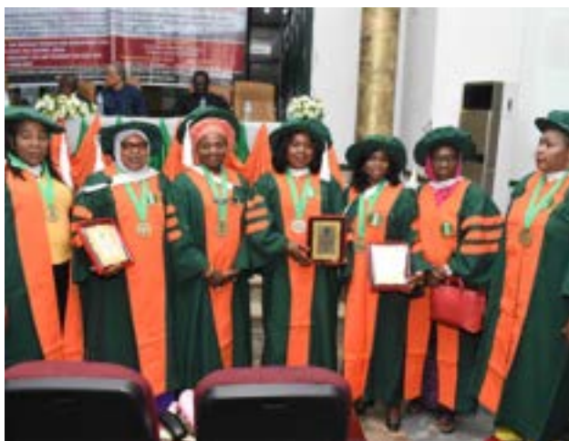
Newly inducted fellows at the 12th MCPD