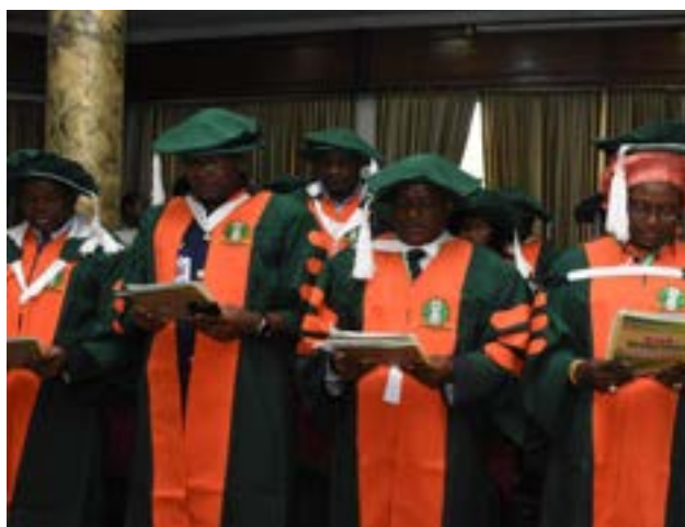
Some Fellowship Awardees at the 12th MCPD