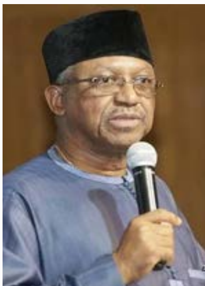
Honourable Minister of Health, Dr. Osagie Ehanire

W ith the recent approval from Federal Ministry of Health (FMoH), compelling chemists in the health sector to maintain membership status with the Institute of Chartered Chemists