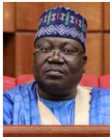
Senate President, Ahmed Lawan

Others include: providing forensic and clinical toxicology services; participating in environmental impact assessment and audit; participating in drug discovery, design and development; formulating and managing production, importation, distribution sale and use of chemicals/chemical products among others.