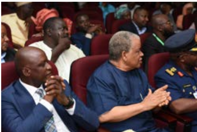
L-R: ICCON Registrar with President of Council