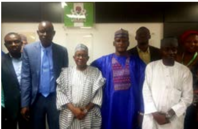
Visit to Perm. Sec. Fed. Min. of Health (center); Registrar/CEO, ICCON (4th left); Dir. Food and Drugs FMOH (2nd left)