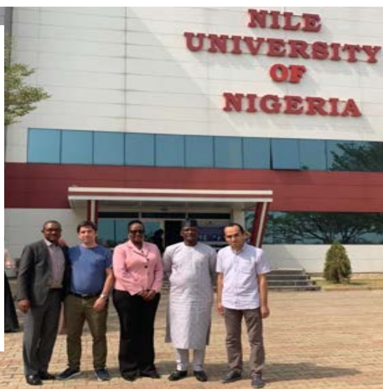
ICCON on a regulatory visit to Nile University, Abuja.