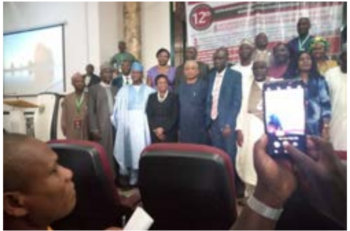
Group photograph of dignitaries at the 12th MCPD